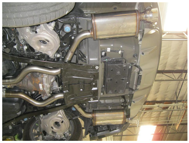
Step 4. Finish the initial installation by fitting the Muffler Assemblies onto the Extension pipes using the supplied 3.00" clamps and inserting the hangers into the rubber insulators.

Step 3. Next attach the Extension Pipe Assemblies to the Y-Pipe using the supplied 2.50" clamps and fitting the hangers into the rubber insualtors.