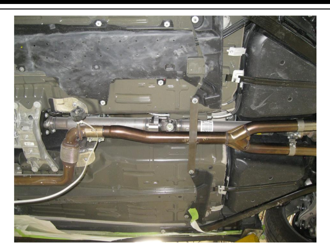
Step 2. Begin installation of the new system by loosely attaching the Y-Pipe Assembly to the outlets using the OEM clamp. Leave all clamps loose until final adjustment.

Step 1. (Notice: This exhaust system fits on both convertible and coupe Mustangs. To install the system on a convertible you must first remove all underbody bracing.) Begin removing the exhaust system by loosening the clamp located in front of the resonator. Next, working front to rear extract the hangers from the rubber insulators and remove the OEM system. Retain insulators and clamps as they will be used to install the new system.