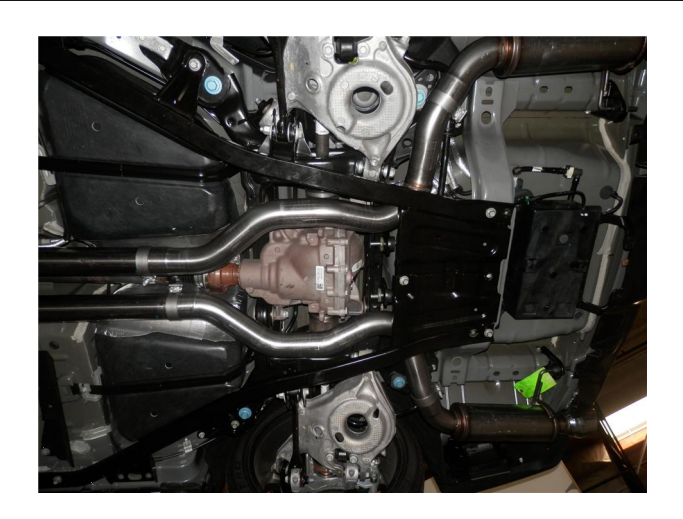
Step 3. Next attach the Mid Pipe Assemblies to the X-Pipe using the supplied 3.00" clamps and fitting the hangers into the rubber insulators.