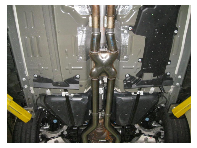
Step 2. Begin installation of the new system by loosely attaching the X-Pipe Assembly to the outlets using the OEM clamps. Leave all clamps loose until final adjustment.

Step 1. Begin removing the OEM exhaust system by loosening the clamps located in front of the resonator. Next working front to rear extract the hangers from the rubber insulators and remove the OEM system. Retain insulators and clamps as they will be used to install the new system.