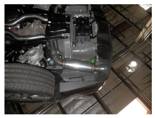
Step 4. Finish the initial installation by fitting the Muffler Assemblies onto the Mid pipe Assemblies using the supplied 3.00" clamps and inserting the hangers into the rubber insulators.

MAGNAFLOW: 22961 Arroyo Vista - Rancho Santa Margarita, CA 92688 | 1(800) 990-0905 Technical Support: 1(800) 959-9226 | Email: moreinfo@magnaflow.com